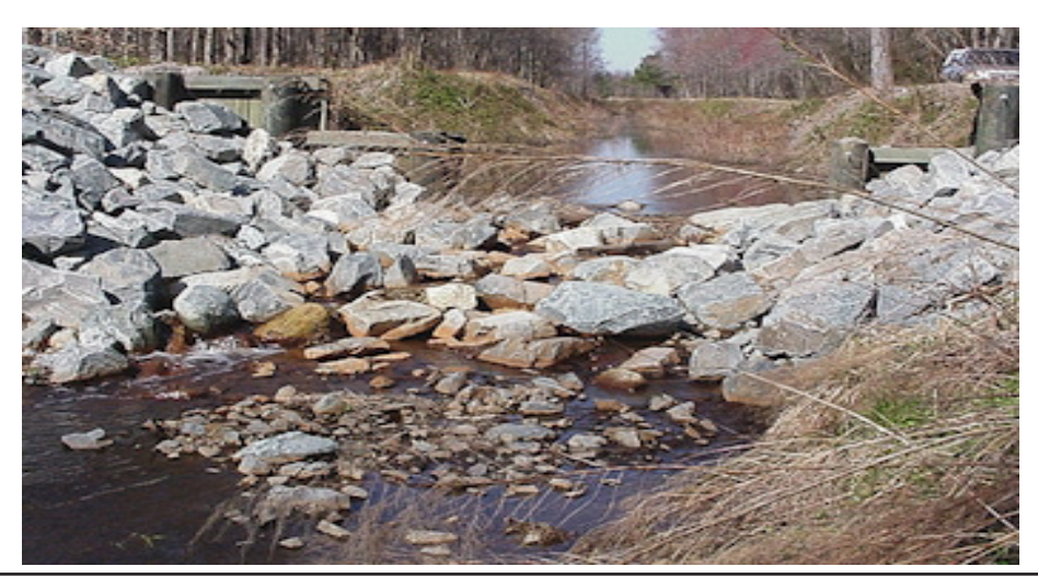
Figure 1 - Typical rock check structure

The Rock Check Dam should be inspected after every rainfall event, and repaired as necessary.