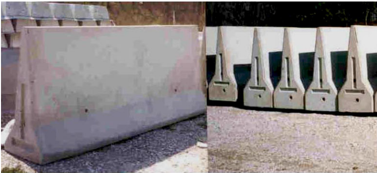
Figure 1 - Typical jersey barriers