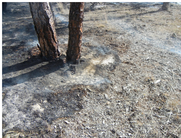
Figure 1. Mulched fuels may burn discontinuously with some areas remaining unburned, while other areas experience long residence times and burn all fuels down to mineral soil. This may lead to greater ecological effects and fire-induced tree mortality, and/or complicate fire suppression.

A regional study of mulched fuels of various ages found that mulch persists with few changes to chemical or physical properties and is still readily combustible after 10 or more years of natural decomposition (Keane et al. 2018), especially in Rocky Mountain dry