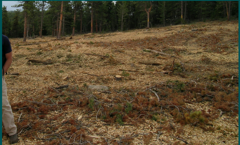
Even and heavily distributed chips. In larger masticated treatment areas in Colorado (several acres or more), average coverage of woody material is about 60% (Battaglia et. al, 2010). However, any given square foot within a treatment area may be fully covered in masticated material or have none at all.

Specifying sizes for trees or brush to mulch (e.g. diameter, height, clump size, and distribution), or the size of clumps or groups of vegetation to retain can manage the depth of mulch debris. If less mulched material is desired on the soil, treatment options that remove biomass from the site, such as whole tree harvest or chipping into roll-off dumpsters, are recommended as a complementary management tool. Actual depth of mulched material on the forest floor can vary greatly across a treatment area. For example, in Colorado depths often average only 0.5 to 2-inches in most areas, with localized pockets of heavier accumulations (Battaglia et al. 2010).