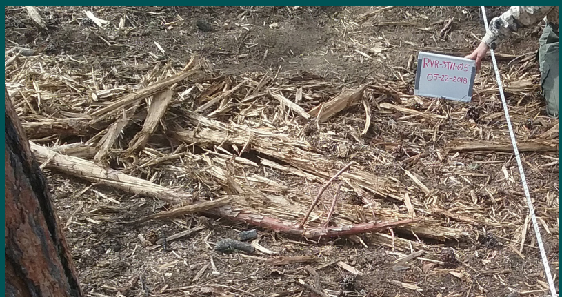
Localized pockets of heavier accumulation