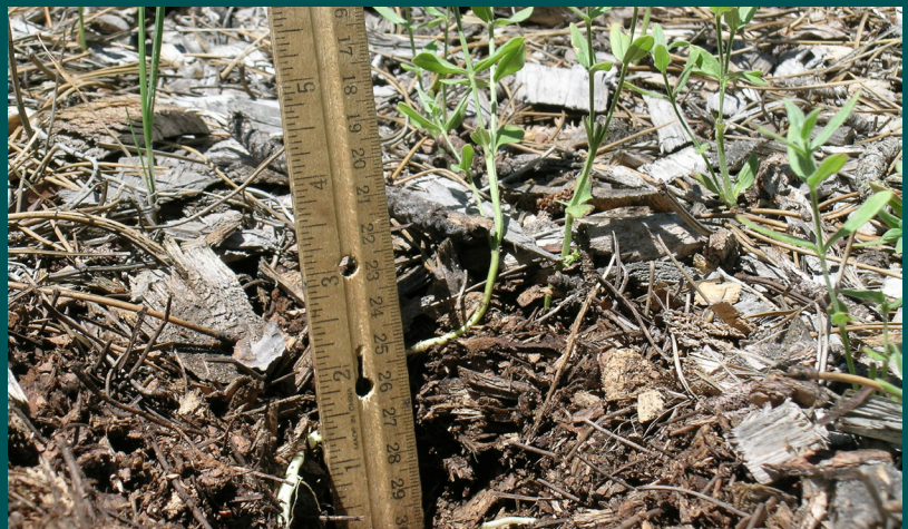
In Colorado, average mulch depth is 0.5 to 2-inches.