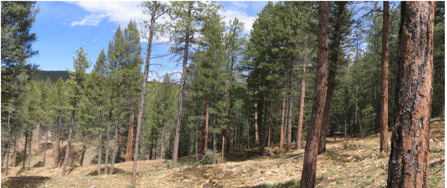
A masticated stand on the South Platte Ranger District.