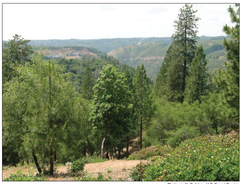
A larger scale plan, such as at the county level, may be best if the goal is to reduce wildfire risk across the landscape.

Reducing wildfire risk across a broad area requires coordination by many partners. A larger scale plan makes that possible. Such plans can forge valuable new relationships and coordination among federal, state, and county fire management offices. Also, larger scale plans are often more strategic, prioritizing projects in terms of risk or coordinating the reduction of fire prone vegetation.