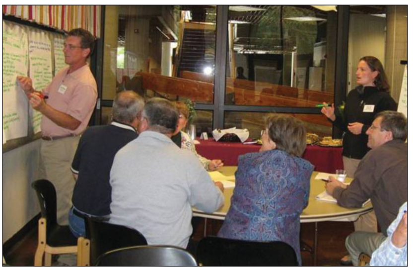
Communities in which citizens are engaged in local issues are primed for developing a CWPP.

Taylor, Florida, is a small, relatively isolated community surrounded by federal, state, and private industrial forest lands. In the 10 years preceding creation of the town's CWPP, the area around Taylor had three major wildfires. As a result, public and private landowners in the Taylor area were well accustomed to working together on fire suppression. By way of the local Taylor Church, community members also had a history of working together; more than half of the town's residents belong to the church.