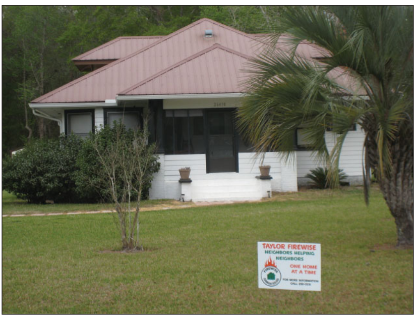
Sometimes others are motivated to become involved when a neighbor takes visible action.

Just as ecosystems vary, communities vary in the resources they can draw on to develop a CWPP. Characteristics such as community norms and values, along with other qualities such as a community's economic diversity, growth trends, and land ownership patterns, affect its ability to launch a collaborative project like a CWPP. But when a community develops a CWPP, it gains not only an action plan, but also more capacity to get things done. The lasting outcome of a CWPP is not necessarily the plan itself but the capacity for action that it builds, the opportunities it creates, the knowledge it advances, and the connections among people and organizations it forges.