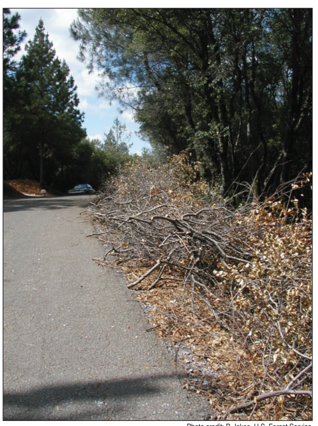
Working together to remove flammable roadside vegetation is a doable project that the community can celebrate and build upon.

The relatively stable group of participants from public fire and land management agencies can help maintain commitment to implementing the CWPP. Continued involvement by community members can help ensure that the document represents and addresses changing conditions.