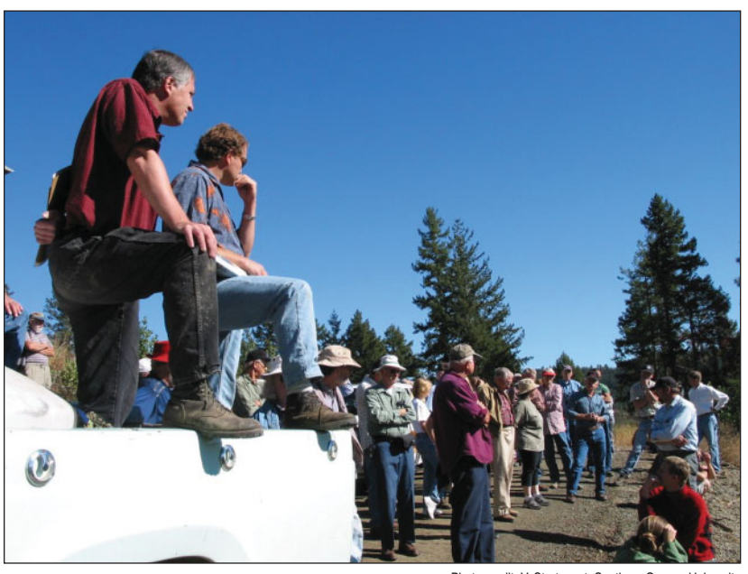
The most effective CWPP frames reflect values held in the community. Group activities can help identify and build shared values.

potentially increasing resources such as funding and available skills. It is important to evaluate who will connect with a given frame—to avoid inadvertently excluding participants—and how a frame might limit possible CWPP solutions and projects.