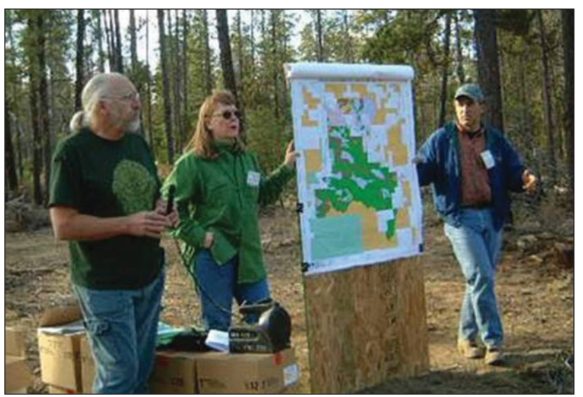
Developing and implementing a CWPP relies on highly motivated individuals who serve as catalysts for action.