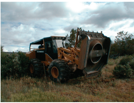
Figure 3: Mechanical treatment using a Hydroaxe .