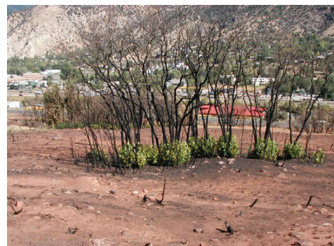
Figure 2: Oak brush sprouting after fire.