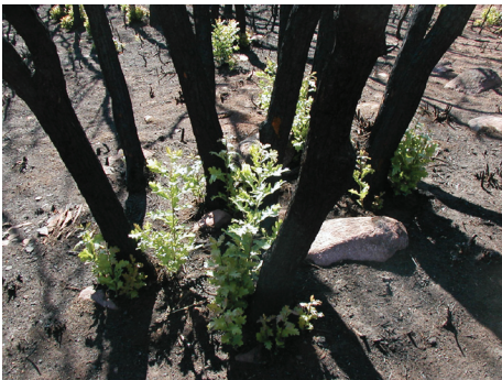
Figure 5: Oak brush resprouting after fire.

to increase available forage for wildlife or livestock. Managed grazing of goats is also an effective treatment to reduce or eradicate oak.