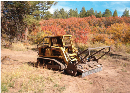
Figure 4: Mechanical treatment using a timberaxe.