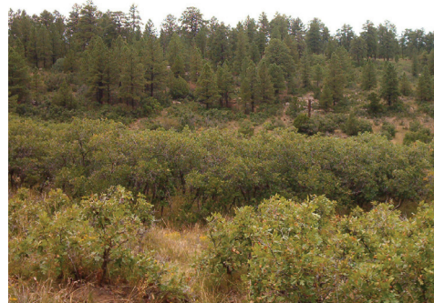
Figure 1: Typical oak brush growth in Colorado.

Various treatment methods have been used to control oak brush in western Colorado, including herbicide, mechanical treatment, and prescribed burning. In many cases, the objective of these treatments is