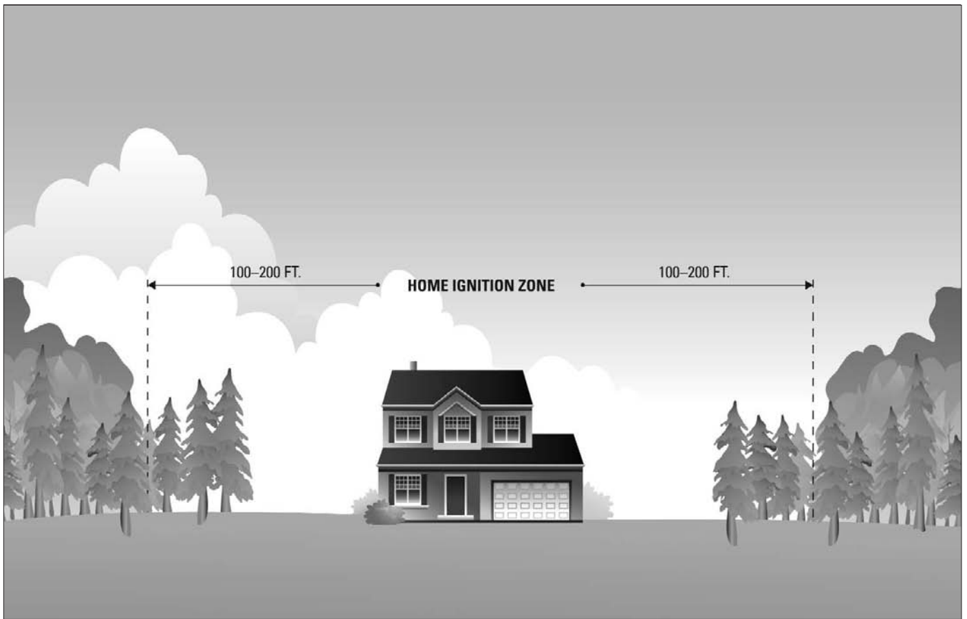
The home ignition zone principally determines a home's ignition potential. The zone includes the home in relation to its surroundings within 100–200 feet of the home.

(crown fires) must be within one hundred feet to ignite a home's wood exterior. Actual case examinations find that extreme wildfire behavior does not occur within most residential areas; rather, most destroyed homes ignite from smaller flames and directly from firebrands. The evidence is unconsumed vegetation surrounding most destroyed homes (pages 21 and 25). Thus, given an extreme wildfire, the home ignition zone principally determines the potential for a WUI fire disaster.